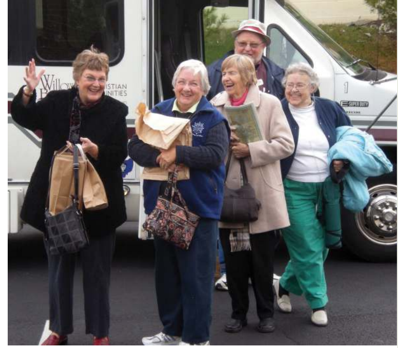
The best part of Willow Brook life is the sense of community you feel from the moment you walk in the door.

needed, and a variety of floor plans and prices.