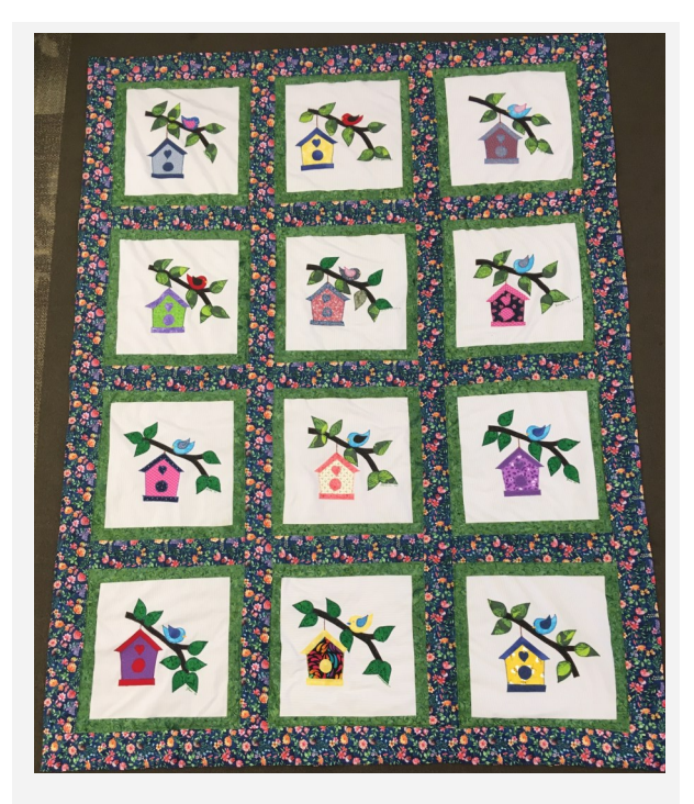
Congratulations to the Centrum ladies for their quilt entry in the Delaware County Fair!