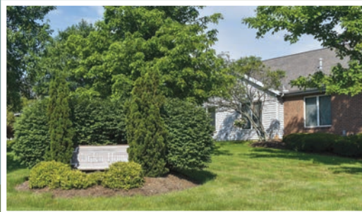
Left, a side view of the Garden Homes apartments from the outside.