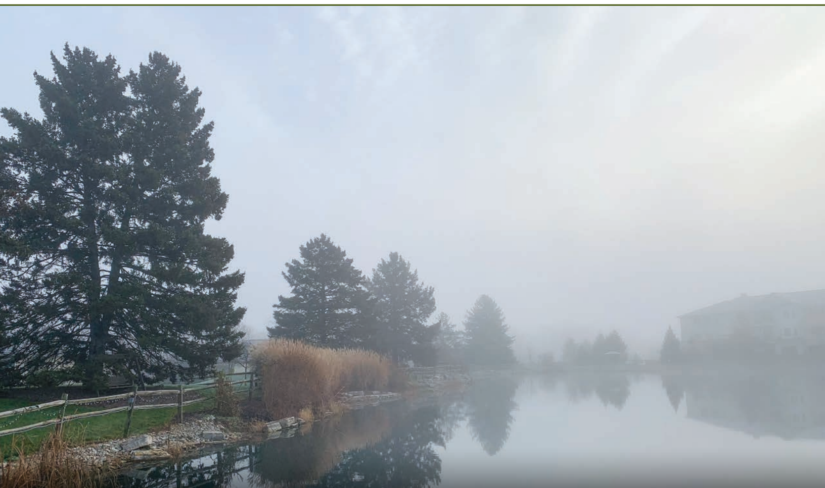
Autumn foggy morning overlooking the lake at Willow Brook at Delaware Run.

NONPROFIT ORG U.S. POSTAGE PAID DELAWARE, OH PERMIT #102