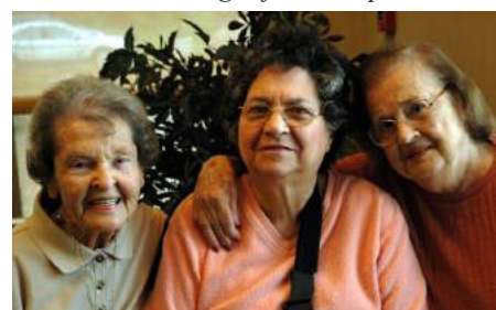
Three amigas gain more than comfort from assisted living.