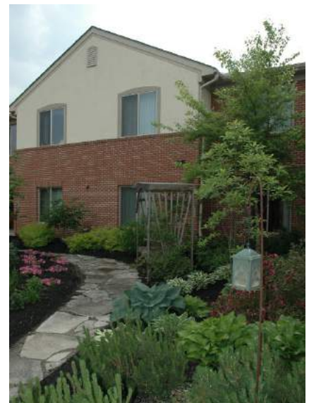
The rooms overlooking one of two courtyards at Willow Brook Christian Home