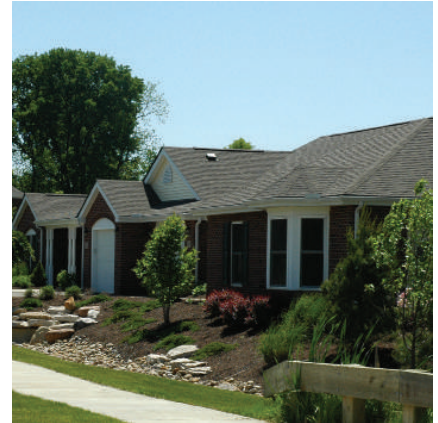
A twin-single home at Delaware Run

The welcome centers are open seven days a week on both independent living campuses, and of course the healthcare centers in Delaware and Worthington/Columbus are always staffed, but it doesn't hurt to call in advance for an appointment. Then you know someone will be able to devote as much time as you need to your questions.