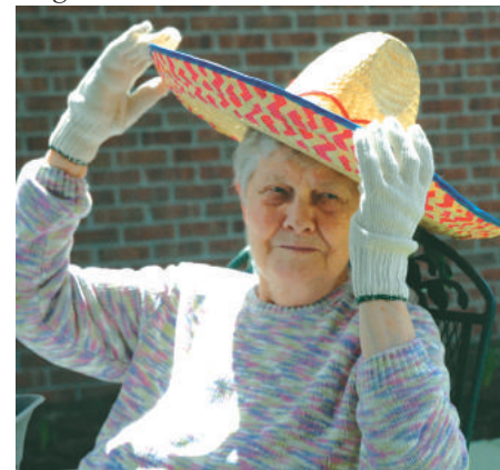
A Passages resident enjoys the first rays of spring