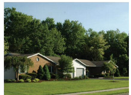
A twin-single home at Willow Brook Christian Village