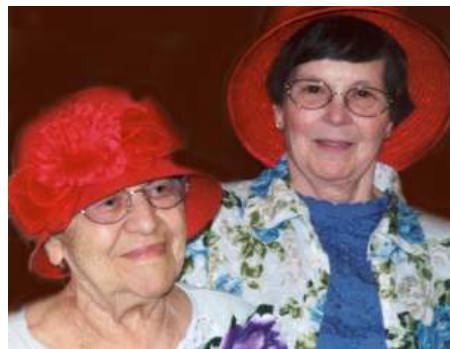
A dynamic activities program enriches lives and encourages friendships.