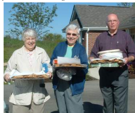
The Delaware Run cookie brigade delivers goodies to construction workers