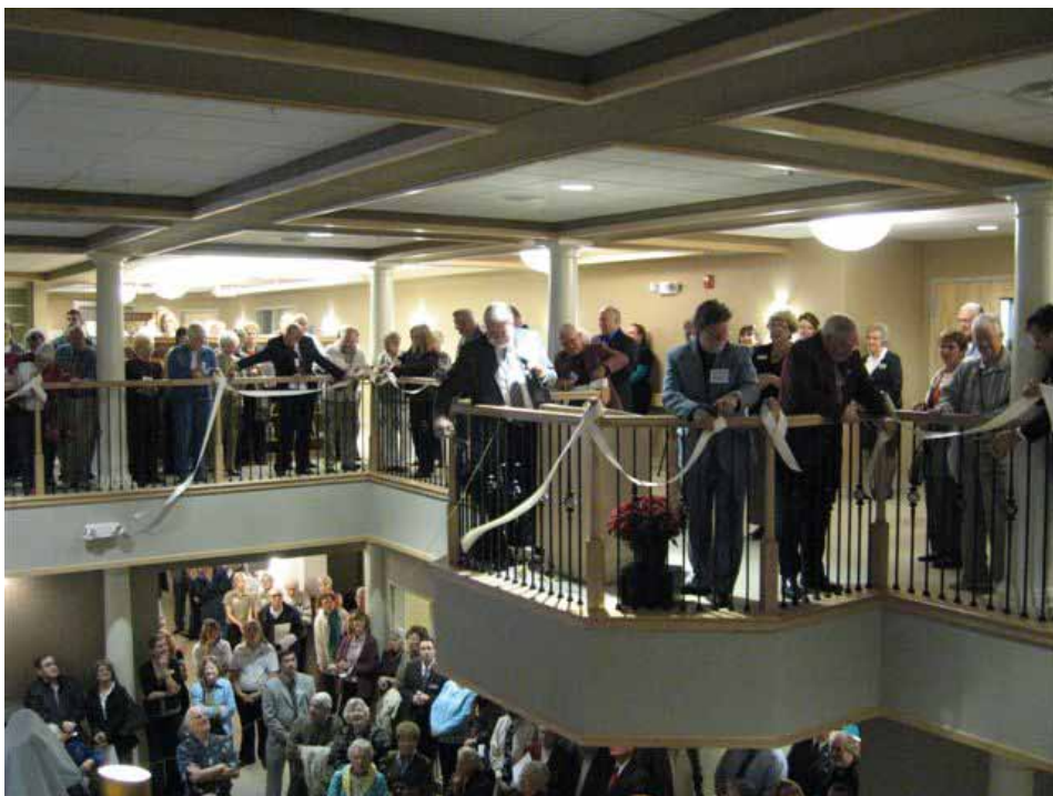
The mayor, Chamber of Commerce president, board of trustees, builders, architects, and funders of the Willow Brook at Delaware Run project all aided in cutting the ribbon at the grand opening festivities on October 8.