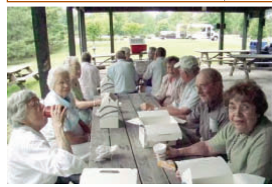
Residents of Willow Brook at Delaware Run took the bus to Dawes Arboretum and the Velvet ice cream factory one day this summer. They enjoyed box lunches at the Dawes picnic shelter during the excursion.

Seems every year we get to prove once again that people who live at Willow Brook do, indeed, eat very well!