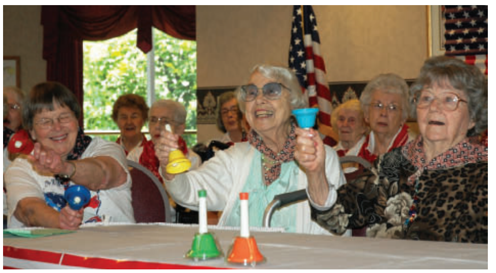
The Village bell choir and the Willow Brook Singers performed at an ice cream social in the Terrace Room at Willow Brook Christian Village this past summer.