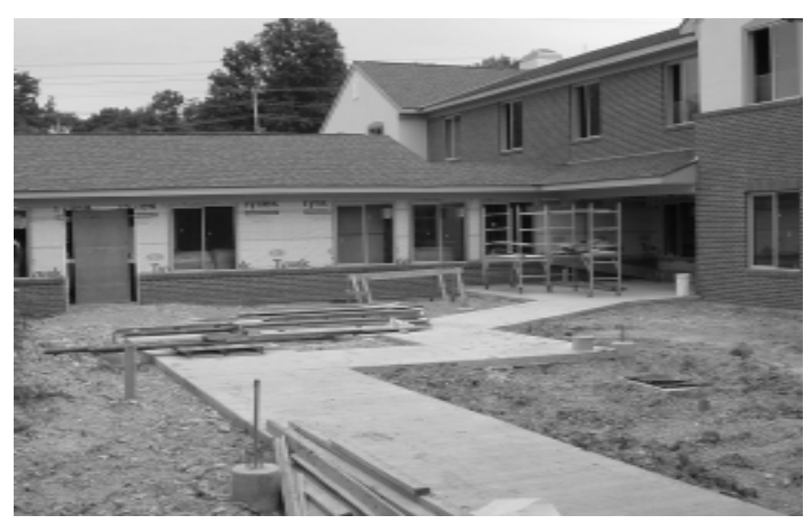
Willow Brook Christian Home construction progress as of September 3, 2004.