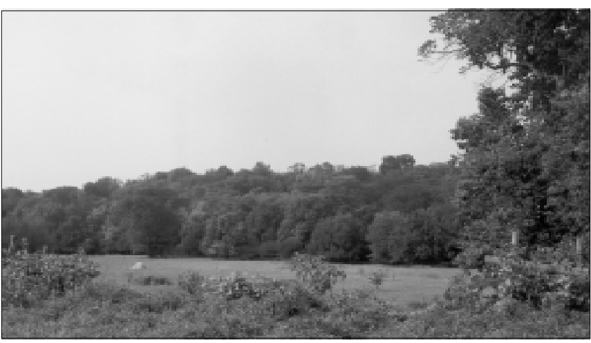
Delaware Run, on West William Street in Delaware, Ohio, is the site for the third Willow Brook Christian Community, Willow Brook Christian Village at Delaware Run.

The land is still in its natural state now, but soon we will break ground for phase one of Willow Brook Christian Village at Delaware Run.